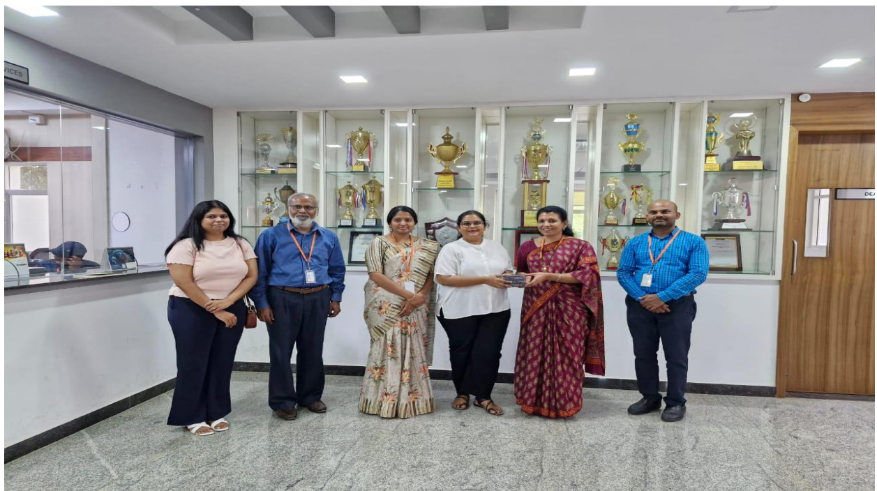
Alumni Vertical Head REVA Business School