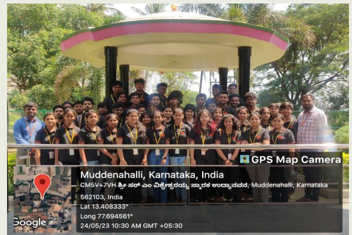
Fig. 2 Visit to Sir MV birth place, Muddenahalli

During the field visit, the subject of civil engineering, the contribution civil engineers have made to the construction of historically significant buildings, and the significance of Sir M.V were discussed. The photos of the visit is shown in Fig. 2, 3.