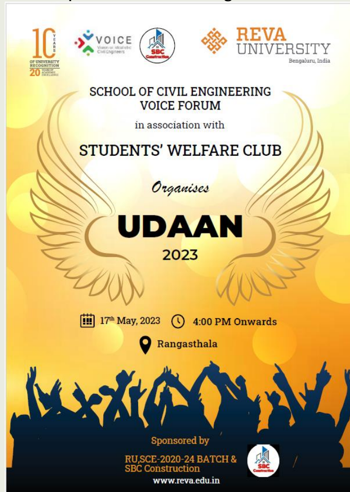
Fig. 1 The Farewell UDAAN 17 th May 2023

The VOICE FORUM in association with the STUDENTS WELFARE CLUB of School of Civil Engineering, REVA University organised UDAAN 2023, a celebration of Farewell Day given to the passing out students' batch at Rangasthala on 17 th May 2023. The students performed dance and cultural activities. The respective class teachers, mentors took care of the students' attendance and the discipline at Rangasthala. The invitation poster is shown in the Fig. 1.