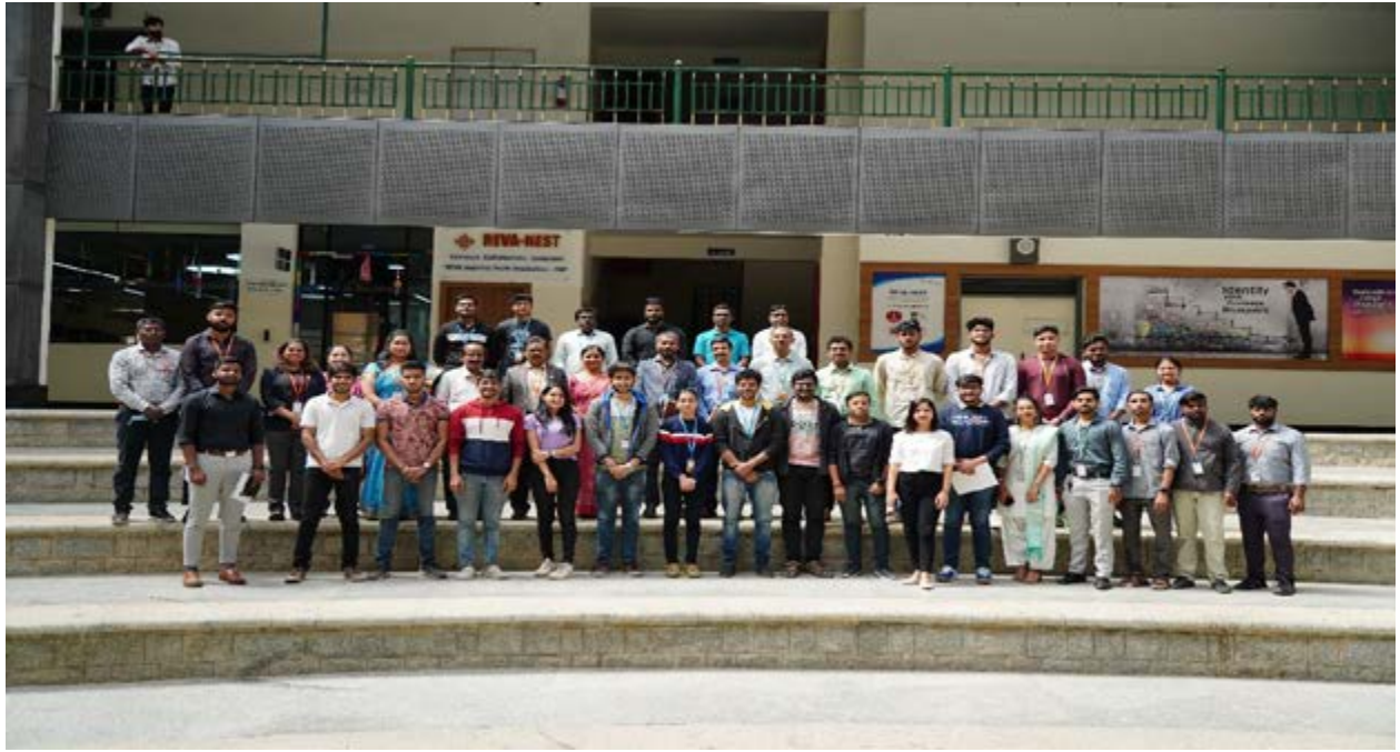
Group Photo on National Startup Day with REVA NEST Incubates along with IIC coordinators, NEST Dean and Pro VC