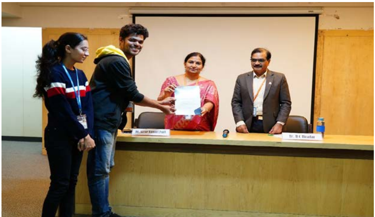
Team ArkVerse NEST Alumni Startup receiving recognition and appreciation certificate from NEST Dean and Pro VC on National Startup Day.