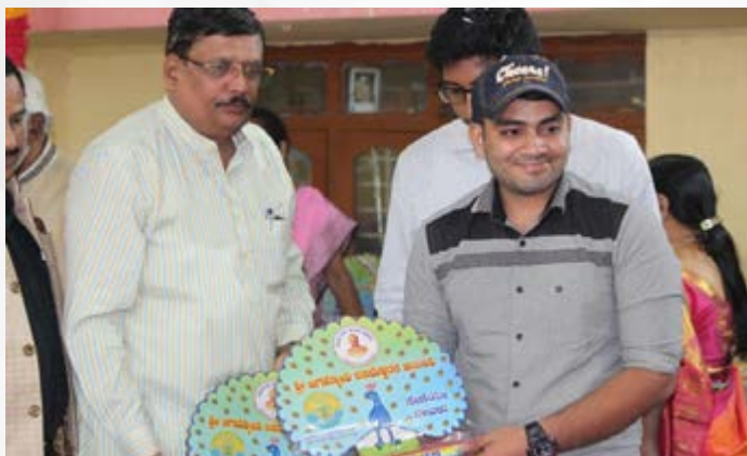
Felicitation of students by chief guests