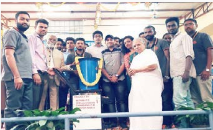
Donation of Leaf Shredding Machine