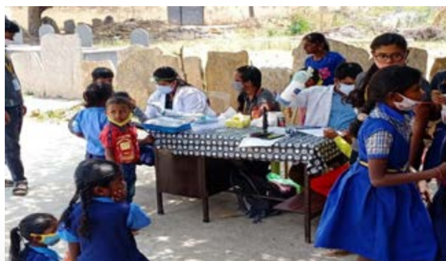
Counsellors addressing the students