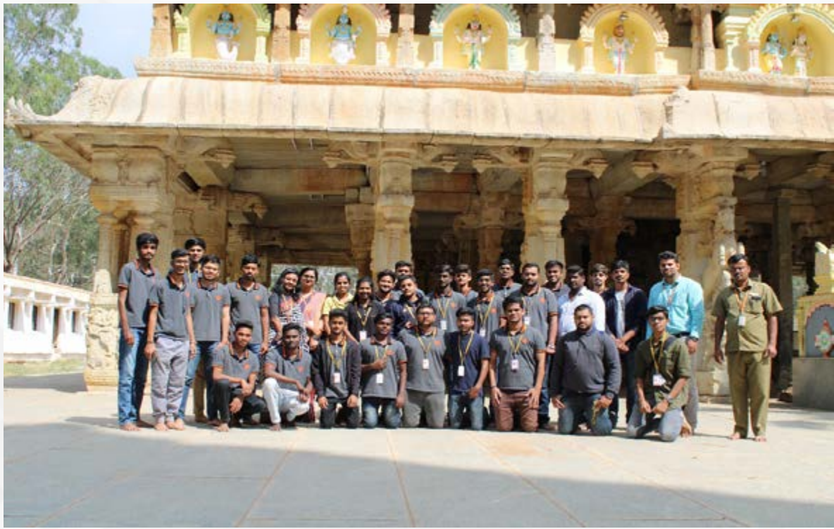
MARS Committee members of the School of Mechanical Engineering