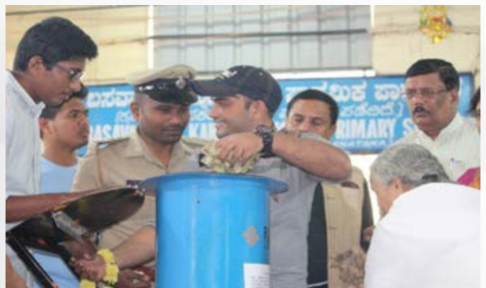
Trial run of Leaf Shredding Machine