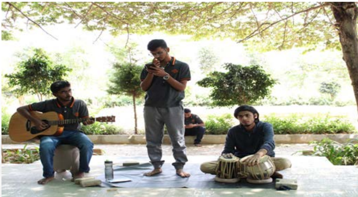
Cultural team getting ready for the performance