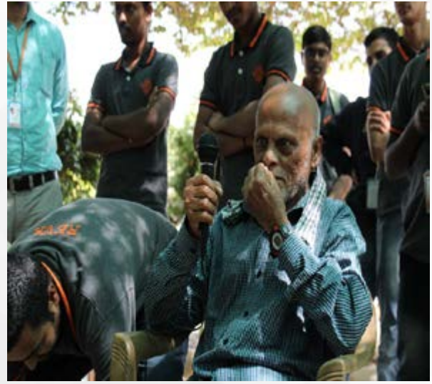
Candid moments during the event