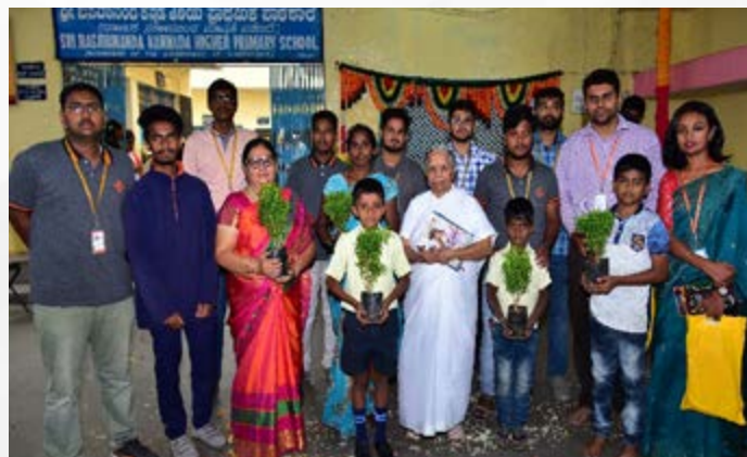
Saplings' distribution to children