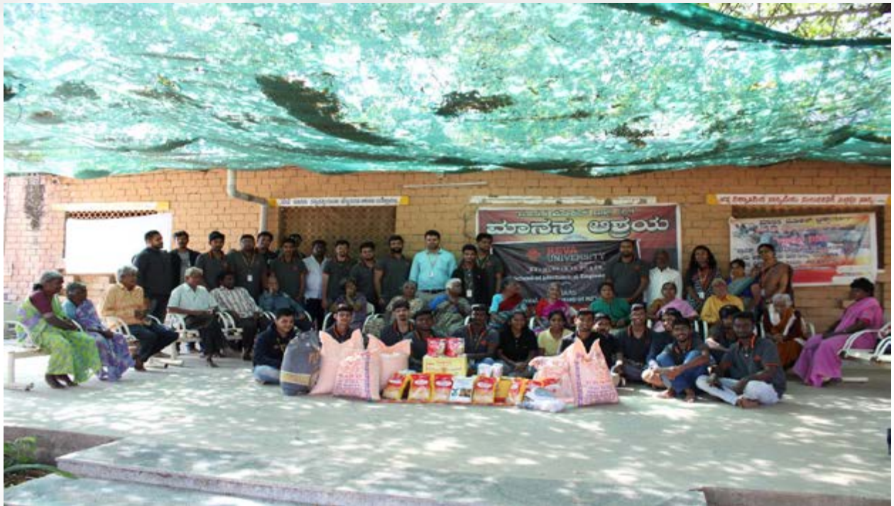
Donation of groceries to the Ashram