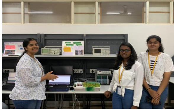
Smart agriculture Monitoring system Shalen,Prerana,sheetal 2nd Multidisciplinary STUDIES