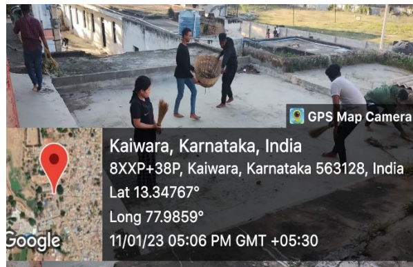
Enthusiastic students engaged in cleaning