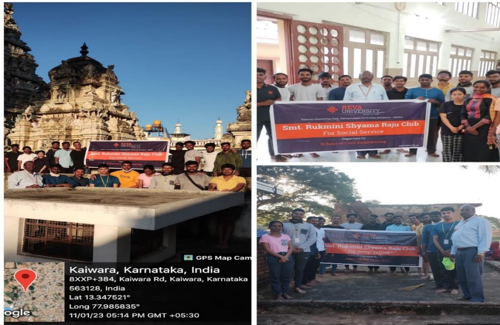
Student Participants of Temple cleaning along with Club banner