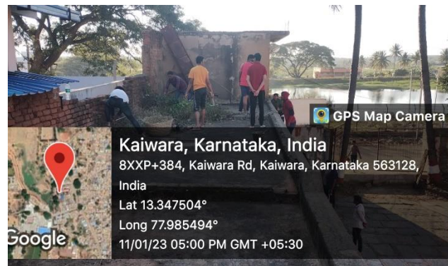
Removal of weeds and clearing the drain pipe