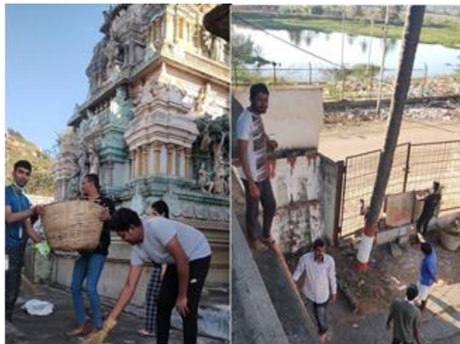
Collection of dust/debris and Conveyance