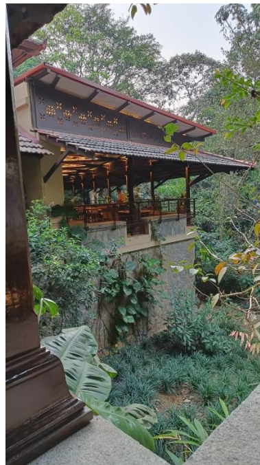
Above : Club Mahindra Resort ( 6B section students)