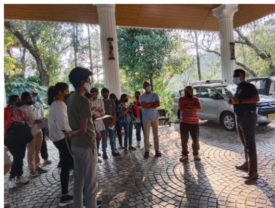
Above : Coorg Wilderness Resort ( 6A section students)